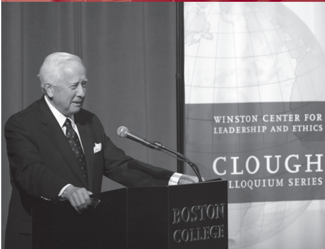
Noted historian David McCullough, at the inaugural Clough Colloquium, addresses a capacity crowd in Robsham Theater.

THE WINSTON CENTER FOR LEADERSHIP AND ETHICS