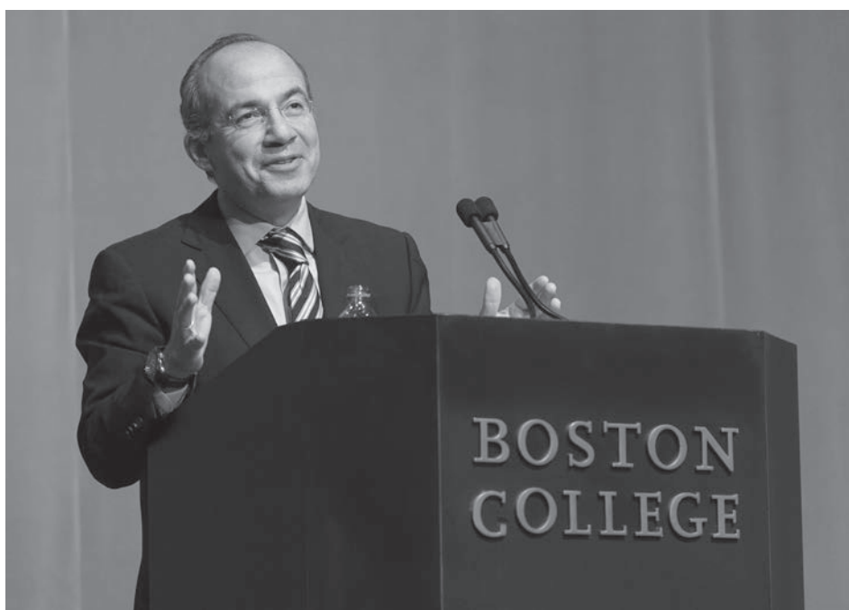
President Calderón speaks to a packed Robsham Theater.