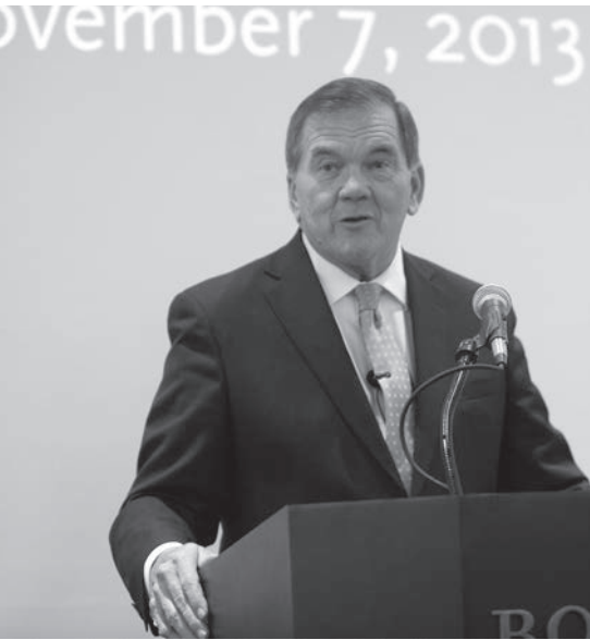
Governor Ridge shares his experiences with the BC community at the Fall 2013 Clough Colloquium.