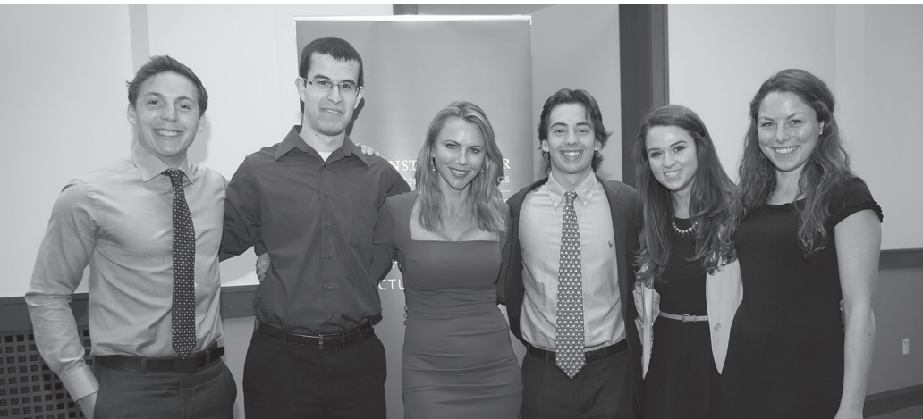
Lara Logan with Winston Ambassadors.