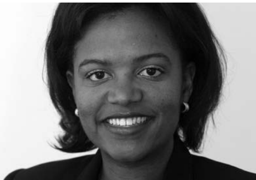
Senator Linda Dorcena Forry Tuesday, September 16, 2014 Fulton Honors Library – 12:00 – 1:30 p.m. By invitation only.

In April 2013, Linda Dorcena Forry was elected to the Massachusetts State Senate. Senator Forry, a native Bostonian, is the first woman and person of color to represent the Commonwealth's 1st Suffolk District, a diverse and thriving cross-section of Boston that includes Dorchester, Hyde Park, Mattapan, and South Boston.