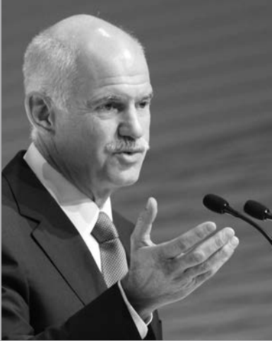
Prime Minister George Papandreou Wednesday, October 8, 2014 Robsham Theater – 4:00 p.m. Program is free and open to the public.