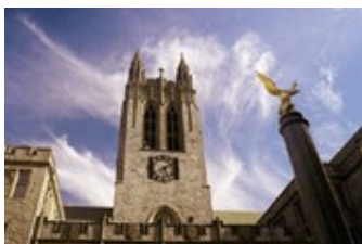
LOWELL HUMANITIES SERIES