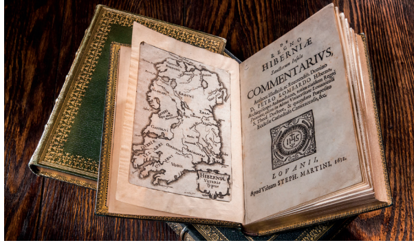
Peter Lombard's De Regno Hiberniae sanctorum insula commentarius (Louvain, 1632) pictured with Philip O'Sullivan Beare's Historiae Catholicae Iberniae Compendium (1621) and John Lynch's Cambrensis Eversus (1662).

ecclesiastical career as provost of the cathedral at Cambrai. A few years later he was called to Rome, where he gained the respect and favor of Pope Clement VIII, who appointed him Archbishop of Armagh in 1601. Clement also appointed him as his domestic prelate, thereby keeping him in Rome for the remainder of his life, safely away from the Protestant oppression of Ireland. Lombard thus wrote his well-known treatise on the Kingdom of Ireland, with its detailed analyses of geographical characteristics and civil and religious divisions, while removed from his native soil. De Regno Hiberniae sanctorum insula commentarius was published posthumously in Louvain in 1632. Charles I considered it so offensive that he gave special orders to his Irish viceroy, Thomas Wentworth, 1st Earl of Strafford, to suppress it.