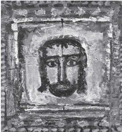
Rouault's Il Santo Volto