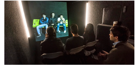
Inside the refugee portal.