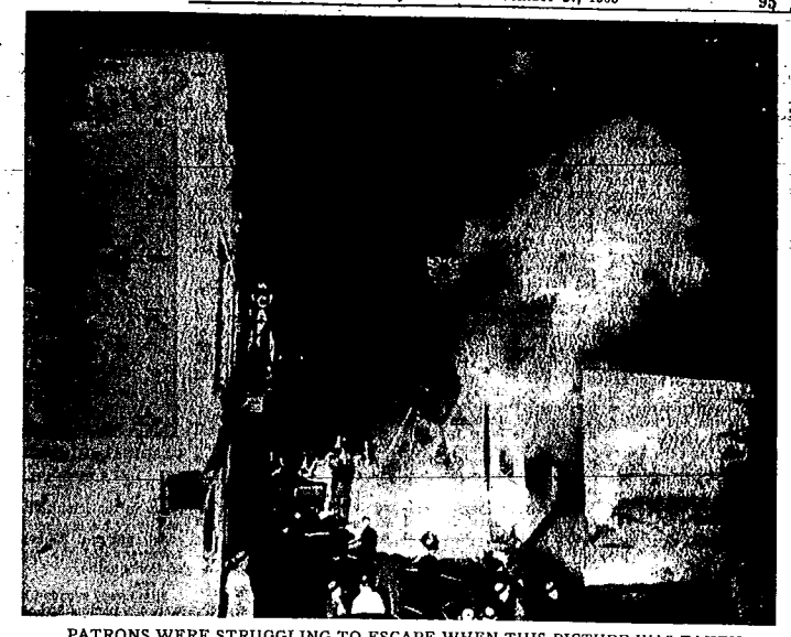
PATRONS WERE STRUGGLING TO ESCAPE WHEN THIS PICTURE WAS TAKEN