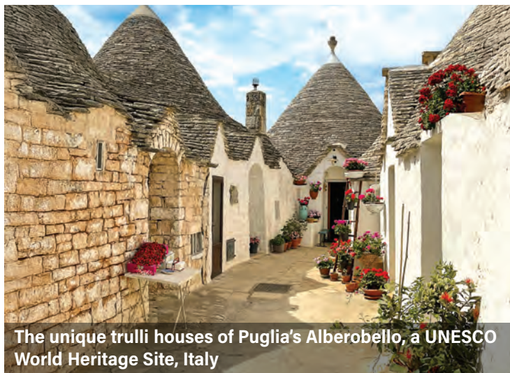
The unique trulli houses of Puglia's Alberobello, a UNESCO World Heritage Site, Italy

Arrive in Venice and transfer to the Splendid Hotel (or similar) for overnight. La Serenissima, the most serene Republic of Venice, founded in the 8th century as a small city-state at the northern end of the Adriatic Sea, by the 13th century had come to dominate not only the surrounding Veneto but also much of the Mediterranean Sea. The massive wealth generated by Venetian trade with the East is still evident in the great public squares and monuments of the city. Gather this evening with fellow travelers for a welcome dinner. (D)