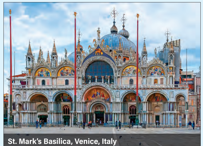
St. Mark's Basilica, Venice, Italy