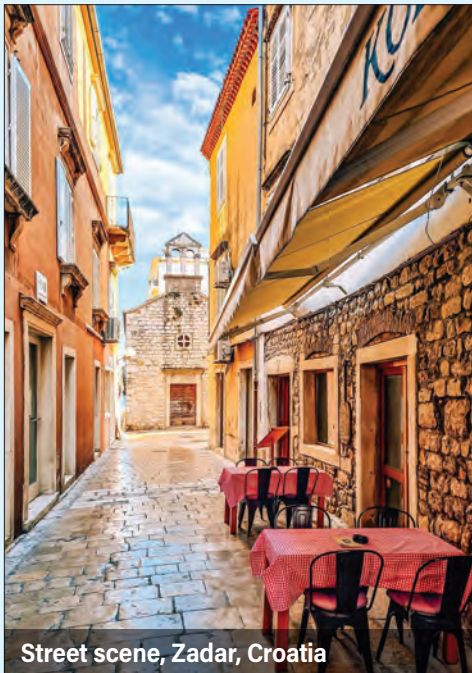
Street scene, Zadar, Croatia