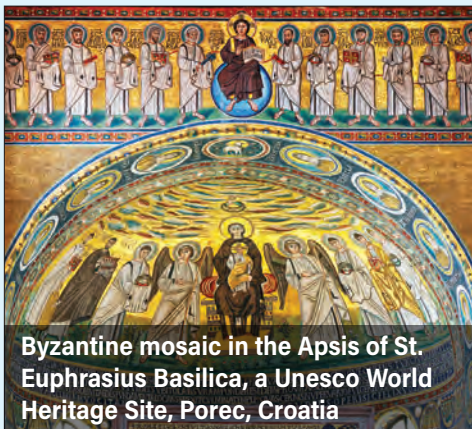
Byzantine mosaic in the Apsis of St. Euphrasius Basilica, a Unesco World Heritage Site, Porec, Croatia