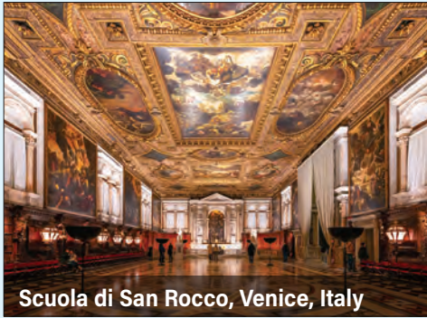
Scuola di San Rocco, Venice, Italy