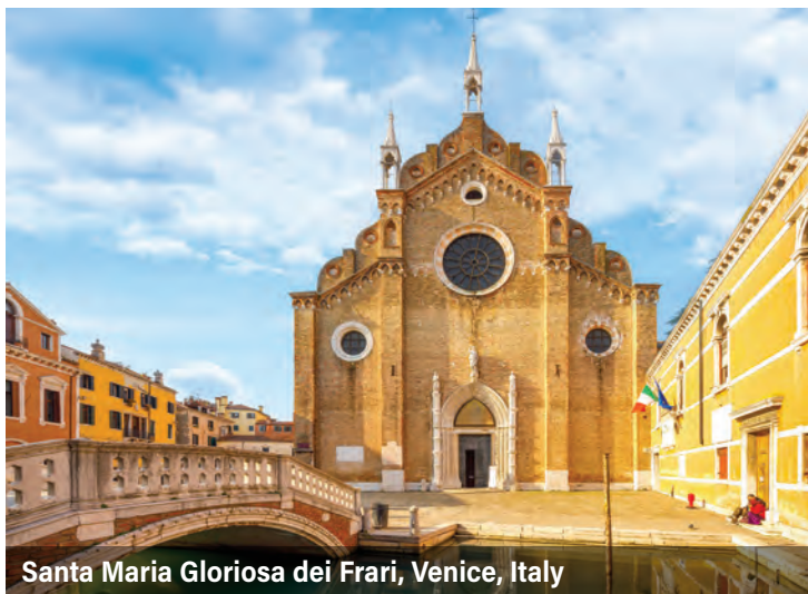
Santa Maria Gloriosa dei Frari, Venice, Italy

Attend lectures, relax, and enjoy the many amenities of the ship as you sail. (B,L,D)