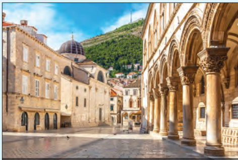
Along Dubrovnik's main street, Croatia