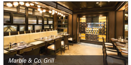
Marble & Co. Grill

Launched in 2024, EXPLORA II is dedicated to maximizing luxury in a relaxed, informal, and friendly environment. With a gross tonnage of 63,900 GT, the ship is comparable in size to vessels that carry over 2,500 passengers, but EXPLORA II has only 461 suites, accommodating fewer than 900 guests. This allows for spacious suites (the smallest suite is 377 square feet) and extensive public areas, including 67,000 square feet of outdoor deck space, twelve bars and lounges, multiple indoor and outdoor pools, and over 10,000 square feet of fitness and wellness facilities. All of this with a staff to guest ratio of 1 to 1.25.