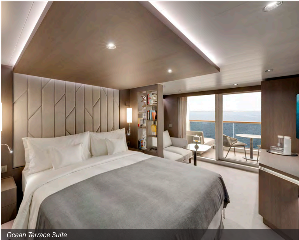
Ocean Terrace Suite