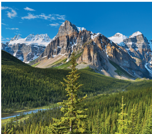
The natural beauty of the Canadian Rockies' jagged peaks

He studied geology at Bates College, finishing in 1993. He received his PhD from MIT in 2001, and conducted postdoctoral research for the US Geological Survey in northern California. Since arriving at Boston College in 2004, his research has focused on rivers and associated land-management issues in the eastern United States, such as dam construction and removal, reservoir sedimentation, and changing flood risk.