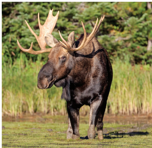
Moose abound in the Rockies.

Day 11: Banff/Depart for U.S. We transfer this morning to the Calgary airport for our flights home. B