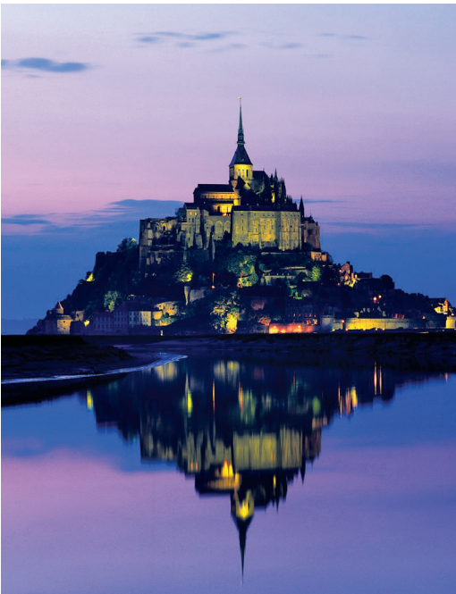
Mont St. Michel at Night

Day 14: Paris Today we get acquainted with one of the world's greatest cities, seeing the highlights on this morning's city tour, including a guided tour of Musée Rodin, a museum dedicated to prolific French sculptor Auguste Rodin. This afternoon is free for independent exploration; tonight we gather for a farewell dinner to bid " adieu " to France. B,D