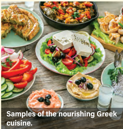
Samples of the nourishing Greek cuisine.

NOT INCLUDED: International airfare; travel insurance; expenses of a personal nature; any items not mentioned in the itinerary or the above inclusions.