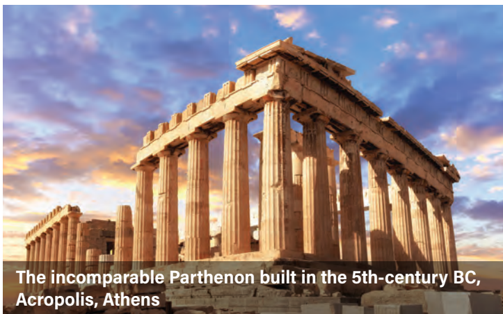
The incomparable Parthenon built in the 5th-century BC, Acropolis, Athens

Transfer to the airport for the return flight home. (B)