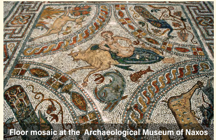
Floor mosaic at the Archaeological Museum of Naxos