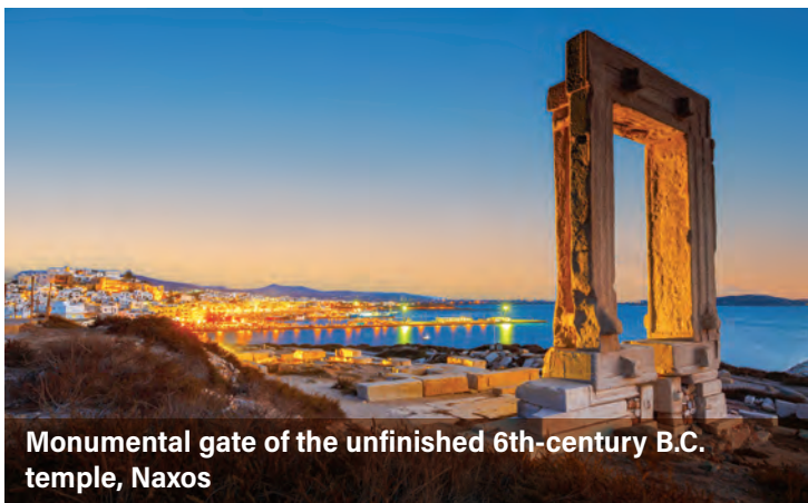
Monumental gate of the unfinished 6th-century B.C. temple, Naxos

Tour in the morning Chora, Naxos's capital town, its narrow streets spread below a citadel built by the Venetians, who held Naxos from 1207 to 1537. Visit the archaeological area of Metropolis; the Roman Catholic Cathedral of the Presentation of the Virgin; and the Archaeological Museum. Facing the town is a small islet, connected to the town by a causeway, on which are the remains of a temple built in the 6th-century BC. Surviving is the monumental monolithic doorway. After lunch, sail to Santorini. As the boat