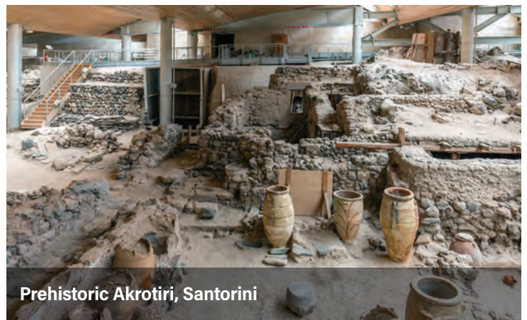
Prehistoric Akrotiri, Santorini

Visit in the morning the superb Museum of Prehistoric Thera, which