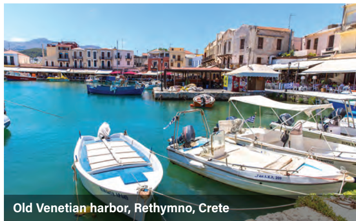
Old Venetian harbor, Rethymno, Crete

One of the most venerable cities, Athens is Europe's oldest city. Its ancient monuments are testimonials to its glorious past that gave birth to democracy and many other ideas and concepts that