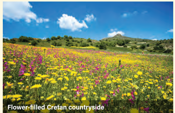
Flower-filled Cretan countryside