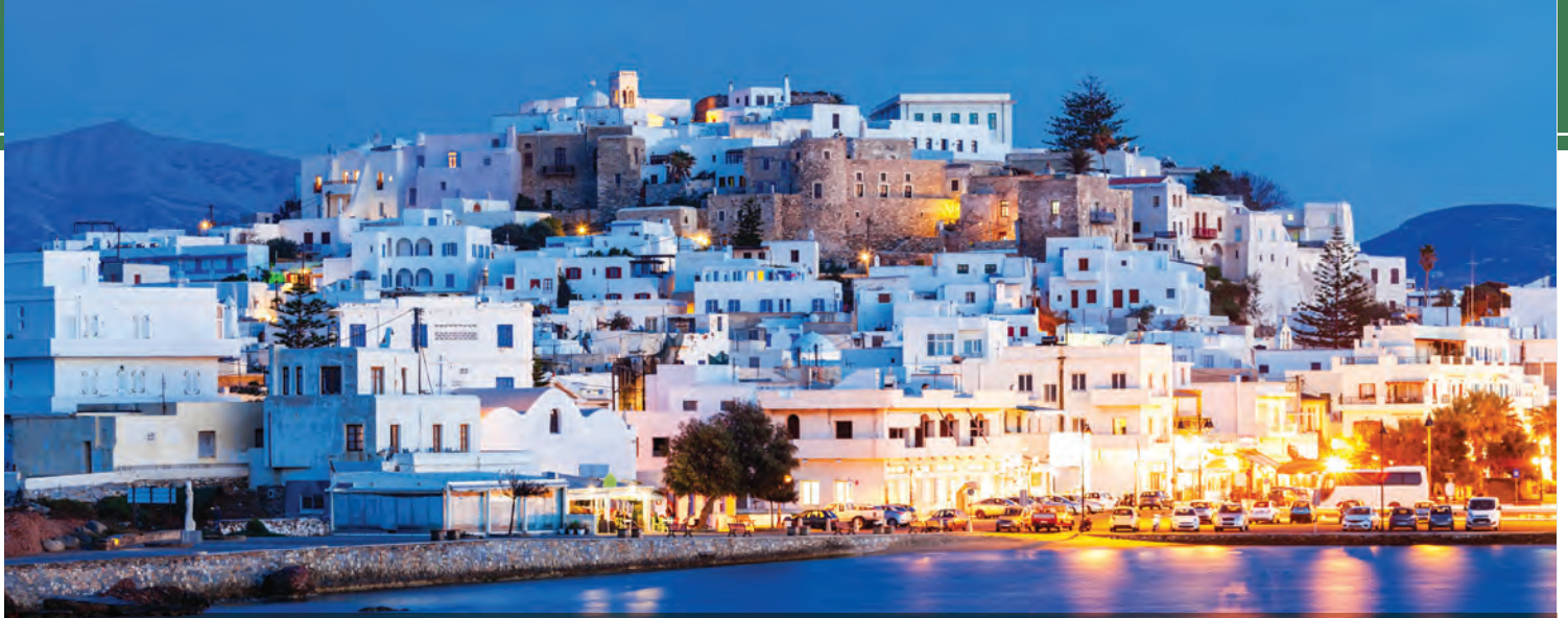
The picturesque town of Naxos.

provides a fine introduction to Santorini's Bronze Age civilization, and whose exhibits include items found during the Akrotiri excavations, including murals that decorated houses. Then drive to picturesque and photogenic Oia, which commands the northern entry into the caldera. Nearby is the Domain Sigalas, where we will enjoy lunch, accompanied by the estate's excellent wines. In the afternoon, sail across the blue Aegean to Heraklion, the main city and commercial center in Crete. After dinner at a local restaurant, check in at the Hotel Megaron . (B, L, D)