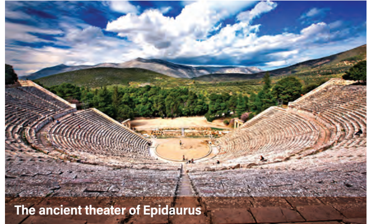
The ancient theater of Epidaurus

approaches the island, view the spectacle of the white-washed town perched on the 1,000-foot-high caldera. Accommodations for the next two nights at the Hotel Volcano View . (B, L, D)