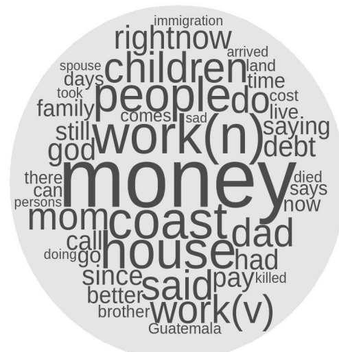
Figure 3. Living to Work, Working to Live and Love

Migrating for work and love. As suggested in the Word Cloud below (see Figure 3), love and work are performed through internal and external migration. Money is secured through borrowing, doing, and going, and always rooted in a belief that “one can.” Maya are grounded in and committed to family (children, spouses, siblings, and parents) well-being and to sustaining home/house/land in Guatemala and, for many, in the presence of God—despite death, murder, disappearance, and sadness. The Word Cloud analysis reiterates and confirms the discursive constructions and transformative performances through which parents’ crossings of multiple borders, civilly disobediently challenge migratory regulations and walls, thereby centering and re-centering their human rights to work and their own and their families’ well-being [buen vivir].