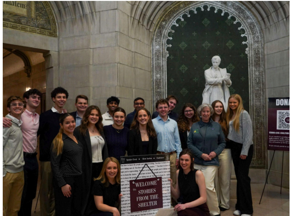
Scholars pose with their poster at their spring event: Stories from the Shelter.

$22,000 for their social justice project. They saw over 250 patients within the new foot clinic and interviewed almost 20 unhoused youth. They presented at the National Public Health Association and have multiple publications in progress.