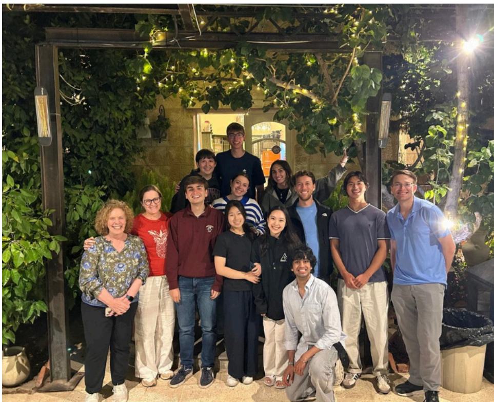
Scholars pictured at the Beit Sitti after learning to cook a traditional Jordanian meal.

Back in Amman, the itinerary continued with visits to Mount Nebo, said to be the burial site of Moses, and the mosaic-rich city of Madaba. The day ended with a dinner at Em Sherif, where Scholars