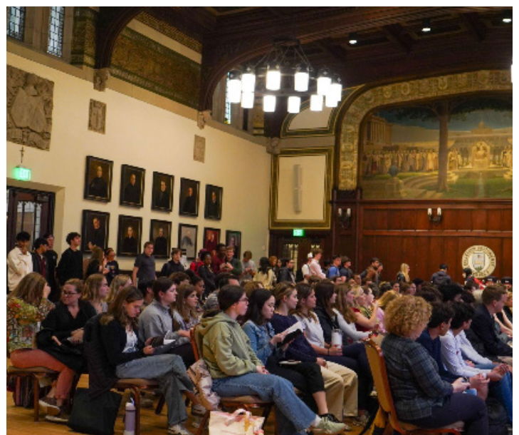
The crowd at the speaker portion of the event