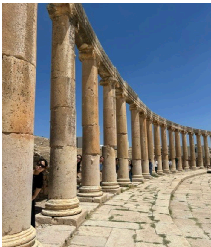
Scholars posing behind ancient Roman ruin pillars at Jerash.

As the Scholars boarded their early morning flight, many looked out at the Amman skyline one last time. What had begun as a whirlwind itinerary had become something much more- a reminder of the complexities and beauty of the Middle East, the power of hospitality, and the privilege of learning through people and place. For the Class of 2026, the trip was not just a final Gabelli journey across borders, but a leap toward global cultural compassion.