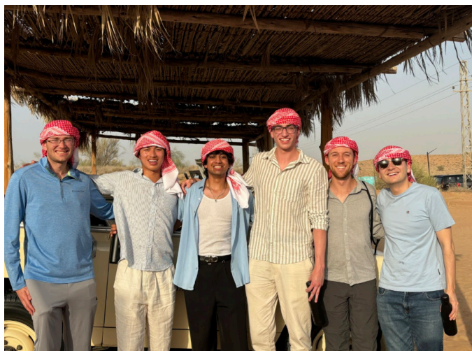
Some scholars pose on the Heritage Desert Safari.

The next day, the group flew to Amman, Jordan, where a different rhythm awaited them. The streets were older, the architecture storied, and the hospitality just as warm. Their first full day was a dive into the city's layered past, with visits to the Citadel, Roman Amphitheater, and Folk-