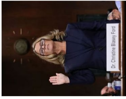
Christine Blasey Ford