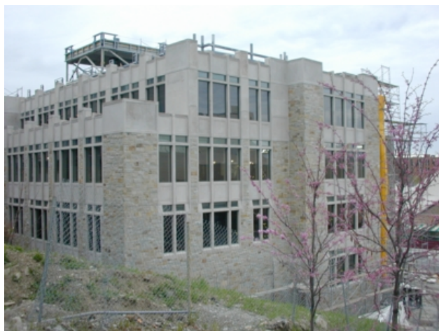
Work continues on the new lower campus faculty and administration building. Fulton Debate will be moving to a new suite of offices on the fifth floor of this building later this fall.