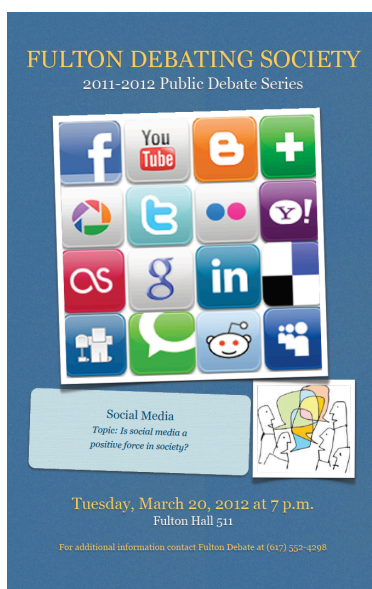
Poster for the public debate on social media.