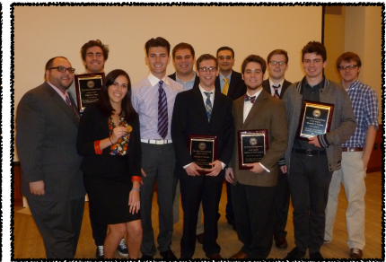
SQUAD PHOTO. Current Fultonians pose for picture (with awards) after the banquet.