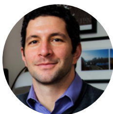
ADAM GREEN PSYCHOLOGY