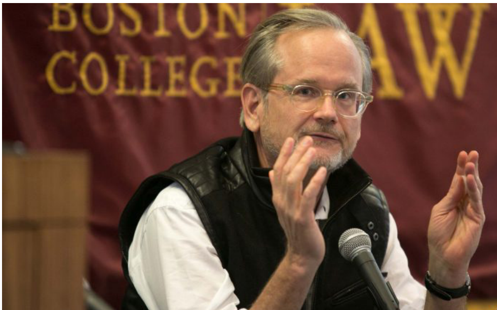
Harvard Law School Professor Lawrence Lessig