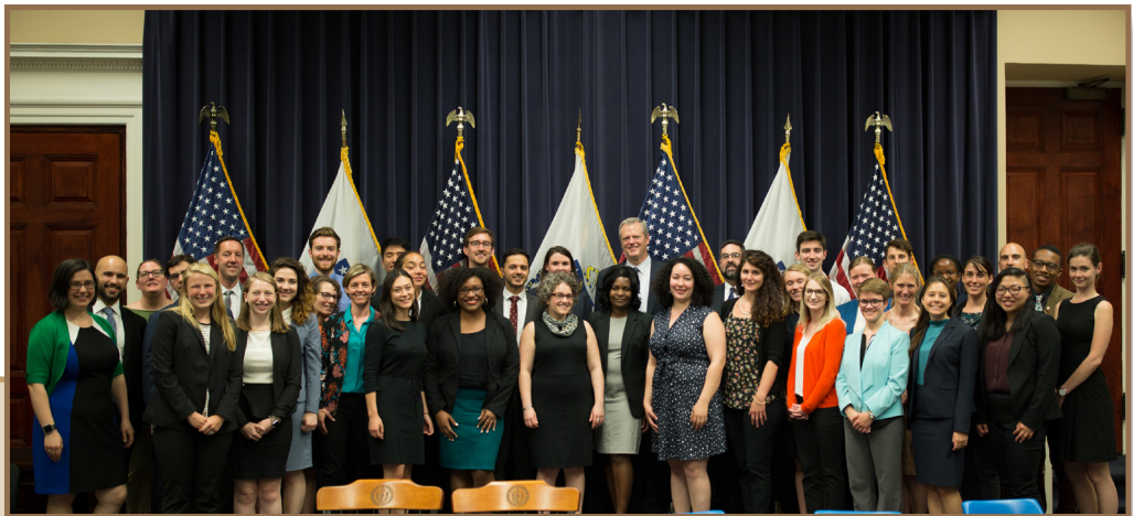
The Rappaport Fellows with Governor Charlie Baker