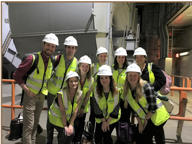
Touring the Haymarket Vent Building

The Fellows also toured the Massachusetts Bay Transportation Authority (MBTA) Control Room; Fenway Park, to better understand the private and public relationships of the Red Sox and the City of Boston in regard to vendors, street closings, and air space; MCI-Cedar Junction; Haymarket Vent Building (the Big Dig tunnel); and the Moakley Courthouse, where the Fellows participated as court clerks in a Discovering Justice mock appellate argument program for middle school students.