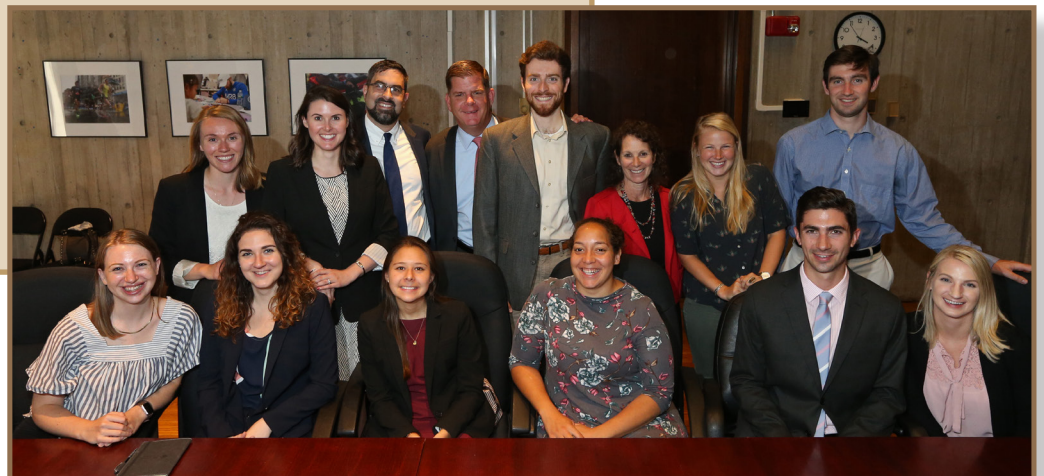
The Rappaport Fellows with Mayor Marty Walsh